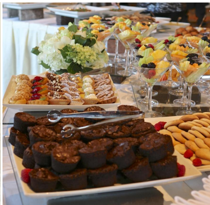
Delicious treats at the Winter High Tea....