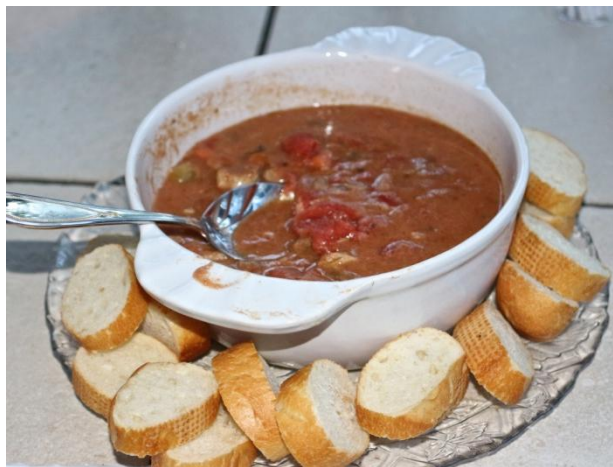
Spring Veal Fricassee