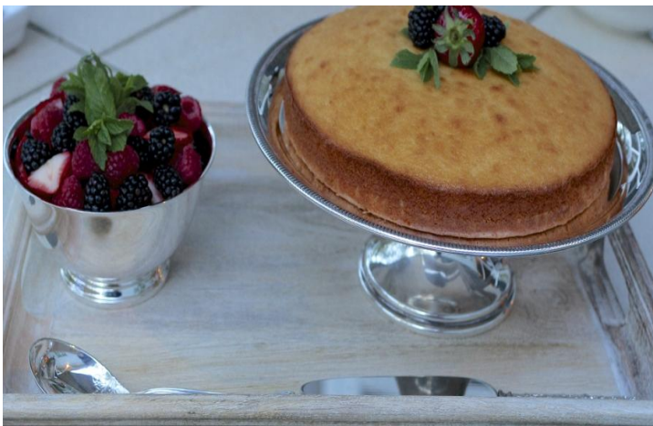
Coconut Cake with Fresh Spring Berries